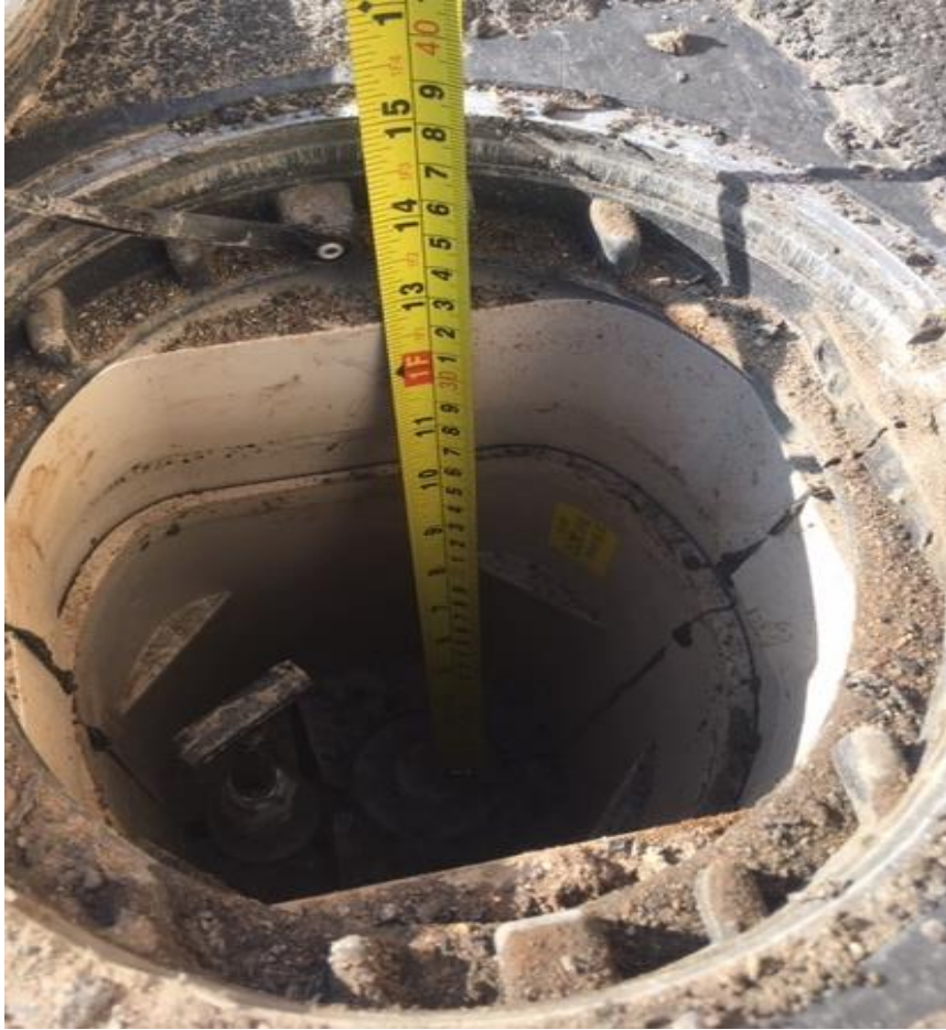
Non compliant boundary box